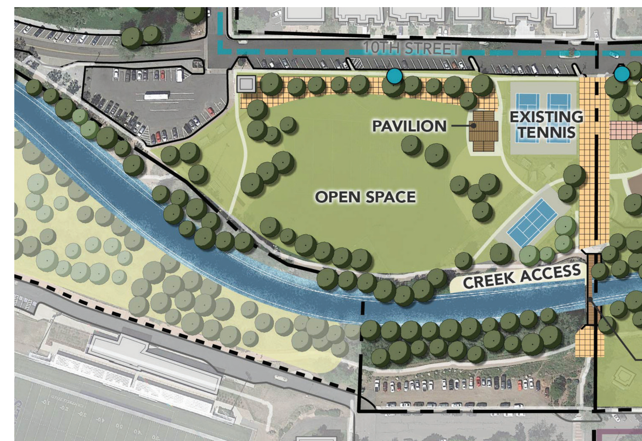
Concept 3: Existing Parking Lot, Existing Tennis Courts, Pavilion, and Open Space