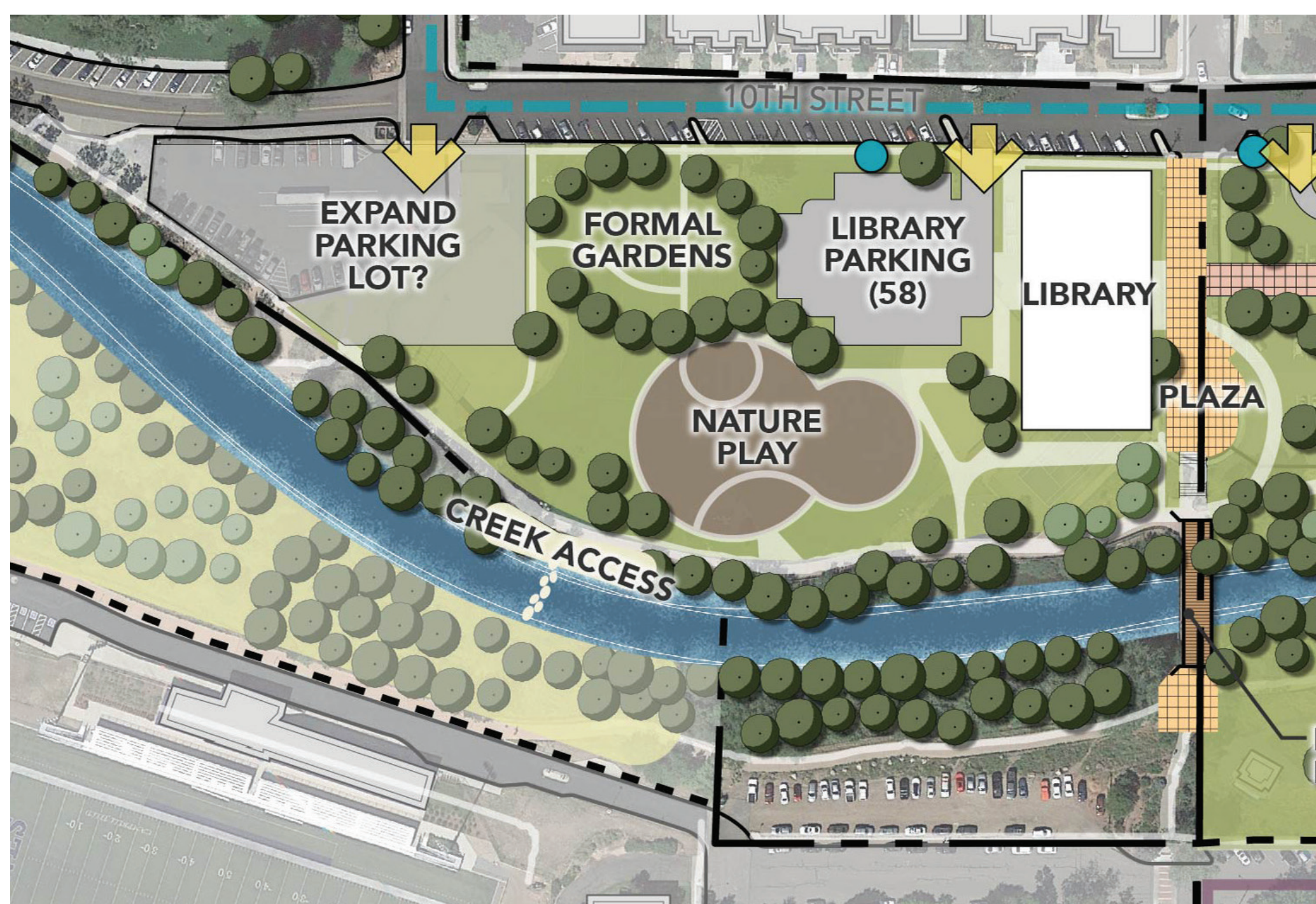
Concept 1: Library, Parking, Formal Gardens, and Nature Play